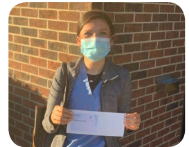
$100 Visa Gift Card Winners